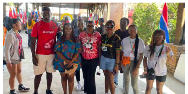
Left: SCSU students at OIF 2024. Right: A student shows off Henna painting and a beautiful smile.

The festival featured a cultural mart with stalls from various nations, offering traditional crafts, artwork, and educational displays. The diversity was impressive, ranging from Kenyan Masai beadwork to Peruvian handwoven textiles. Live acts like Brazilian Samba, Indonesian Gamelan music, and Indian dances were also showcased. The OIF also showcased a diverse range of international cuisine, including Italian pastas, Thai curries, and French pastries, along with regional specialties like Shrimp and Grits. Long lines at booths reflected the high quality and popularity of the products. The 2024 Orangeburg International Festival offered an immersive experience celebrating cultural diversity through interactive activities like storytelling sessions, crafts workshops, and face painting. The festival concluded with a concert, bringing people from all backgrounds together to celebrate their common humanity in an electrifying atmosphere filled with joy and solidarity. A gallery of pictures can be found on the OIF Facebook page at https://tinyurl.com/5ey2zwy8.