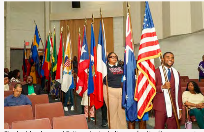
Student leaders and Felton students line up for the flag procession.

Overall, the Spring 2024 International Showcase at South Carolina State University successfully celebrated cultural diversity and provided attendees with a rich, immersive experience. Plans are underway for future events, promising continued opportunities for cultural exchange and education within the university community.