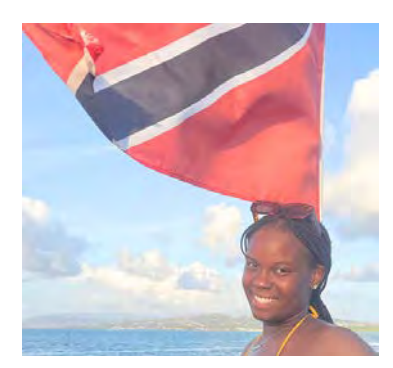
#4: This flag is from which southern Caribbean nation?