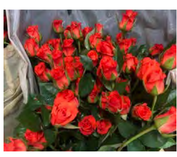
Roses are inspected and graded at the flower farm in Naivasha before packaging.