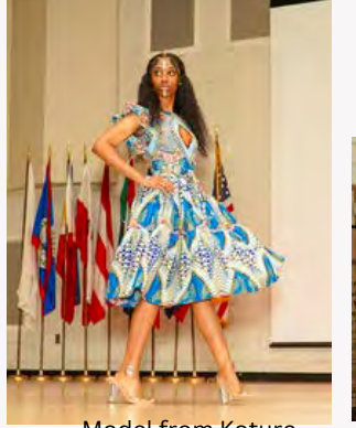
Model from Koture