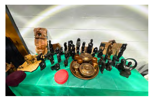
Right: Nigerian sculpture and other artifacts on display.