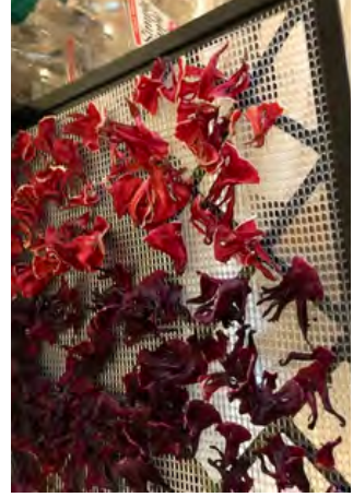
Sorrel drink is made from the bracts of the flowers of the sorrel plant. They are harvested (left) then dried (right). Dried sorrel is steeped in hot water, then the liquid is strained and mixed with sugar, cinnanom, hard spice, bay leaves, and cloves.