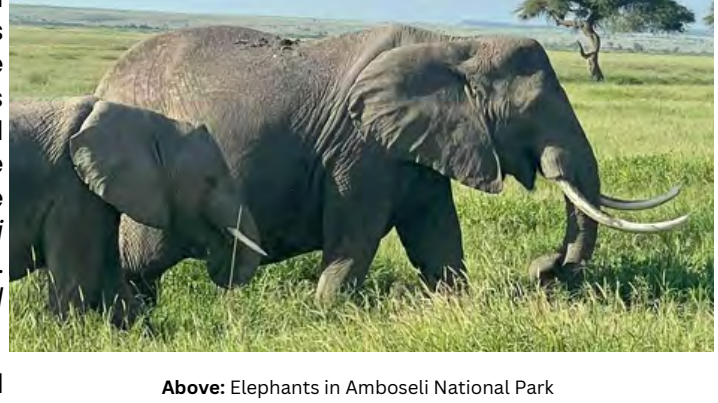
Below: Two fish dishes flank a vegetarian dish in Kenya

The SCSU delegation also visited the Amboseli National Park for a safari to see elephants, giraffe, antelopes, flamingos, and many more animals in their natural habit. The experience in Kenya was exhilarating!