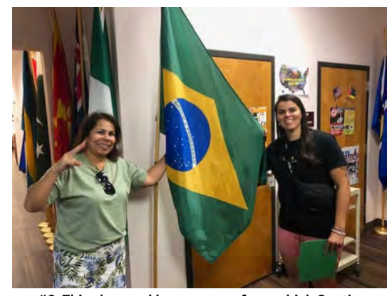
#6: This alum and her mom are from which South American country?