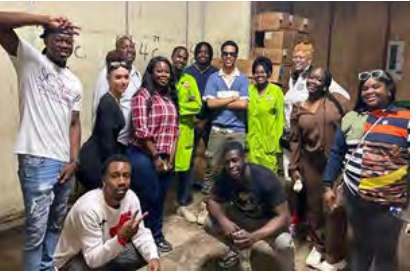
SCSU delegation take pictures with staff in the cooling room of the flower farm in Naivasha, Kenya. Behind them are boxes of roses ready to be shipped to Holland.