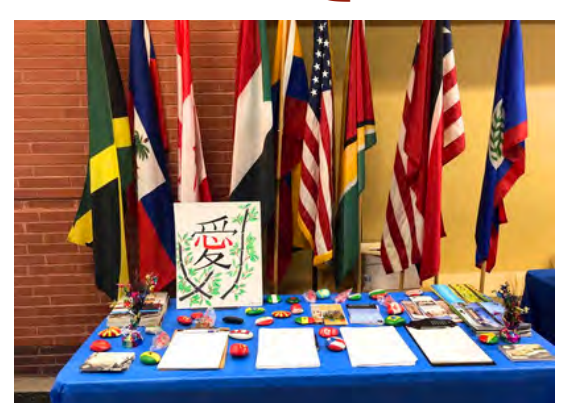
#1: In which building on campus were these flag installed? #2: Identify the nine countries represented by the flags?