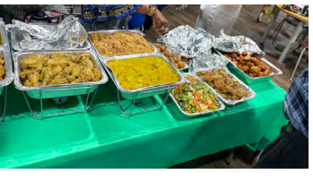
Left: Mouthwatering baked chicken, jollof rice, akara, etc.