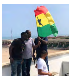
Left: #5: The faculty member (face hidden), alum (holding the flag), and student (at base of flag) are visiting which African country?