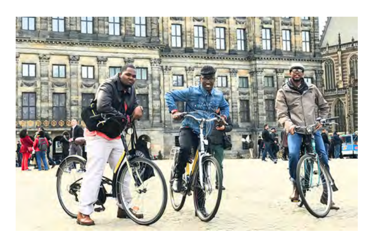
Among the images you will see in the photo galleries on the OINSEP webpage are students participating in cooking Caribbean food at an International Showcase (left) in Staley Hall on campus, and students riding bikes in Amsterdam (right).