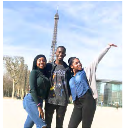
SCSU students in France with the Eiffel Tower in the background, 2018