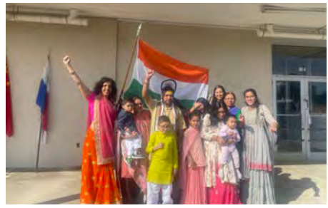
The Indian delegation at OIF 2024.